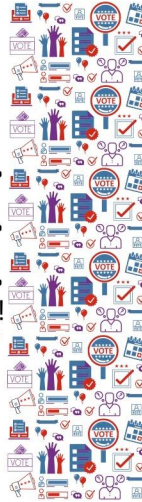
Image of stickers given away at all events

Visit a Civic Corner Today! mountunion.edu/regula-center/umuvotes